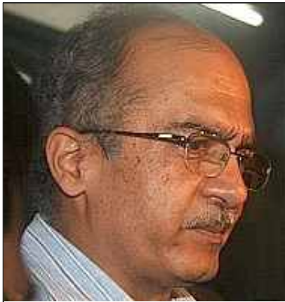
'Chidambaram's role as ex-FM needs to be fully probed'