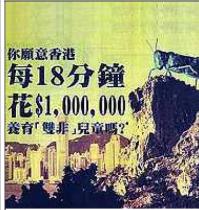
Ad brands Chinese as 'locusts' in HK; sparks anger