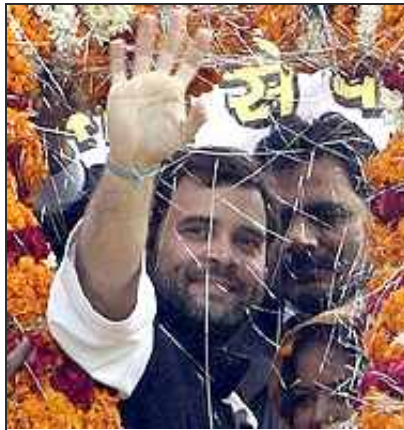
Oust Maya govt like British rule: Rahul to Meerut voters