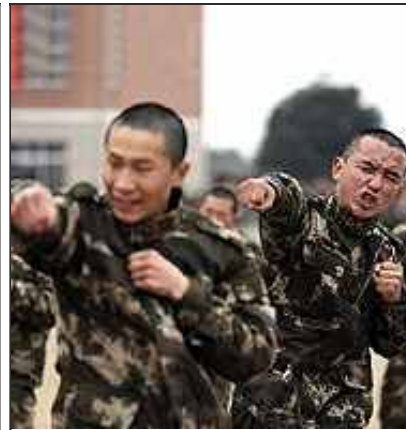
Why India must be prepared to face China militarily