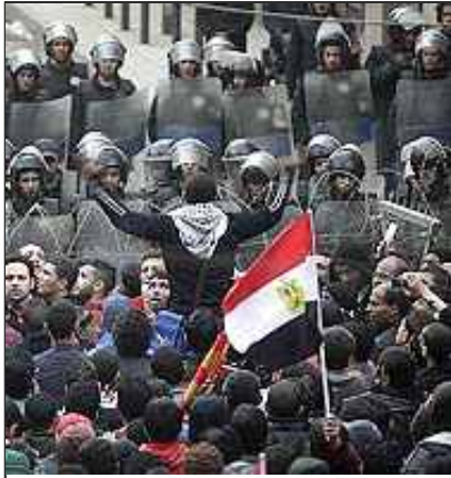
Egypt erupts in rage after football violence kills 74